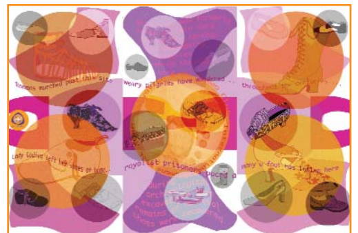
These Boots Were Made For Walking Workshop at the Salvation Army for International Women's week