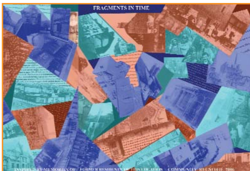
Stirring Memories Former residents of the Belgrade Plaza site