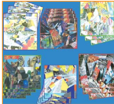
It Will Be Alright On The Night Produced by the Belgrade Theatre