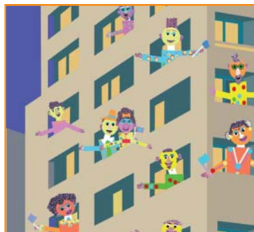
Living The High Life Children who visited the Positive Images Festival in the Lower Precinct