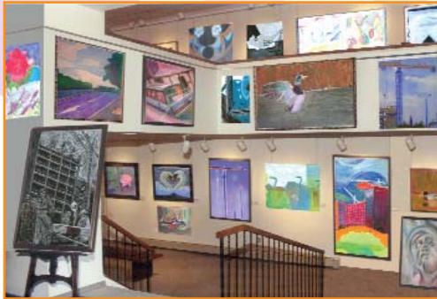
The Lamb Street Gallery Workshop at the Lamb Street Centre

As you go about your business please take the time to enjoy this wonderful work, created by so many local people.