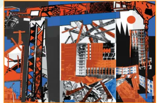
City Rising Barr's Hill Extended Schools Project