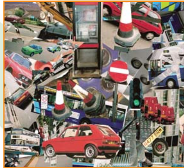
Car City Workshop at the Grapevine Centre