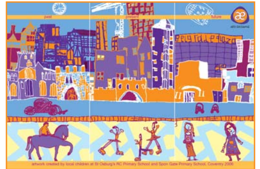
Past, Present And Future Year 5 and 6 children from St Osburg's RC Primary School and Spon Gate Primary School