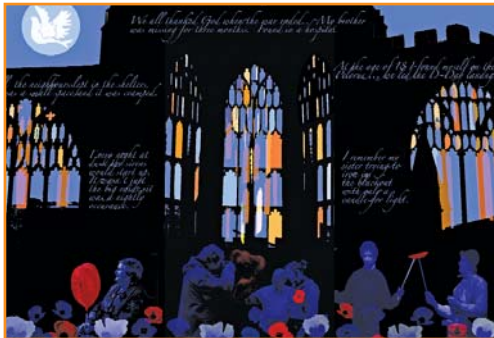
Friendships Built On Time Residents of Bond's Hospital, Foyer and former residents of the Belgrade Plaza Site