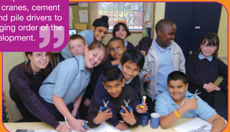
Barrs Hill students having a great time!